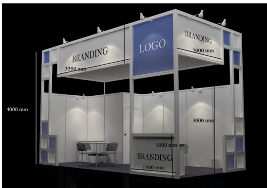
Design 3: 105/m 2

* The package includes 2 KW power supply per 18 m 2 .