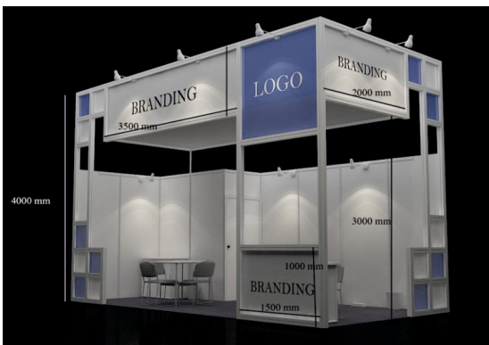
Design 3: 7500/m 2

* The package includes 2 KW power supply per 18 m 2 .